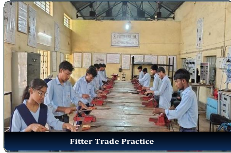
Fitter Trade Practice