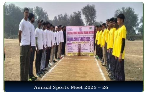
Annual Sports Meet 2025 – 26