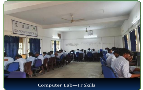
Computer Lab—IT Skills