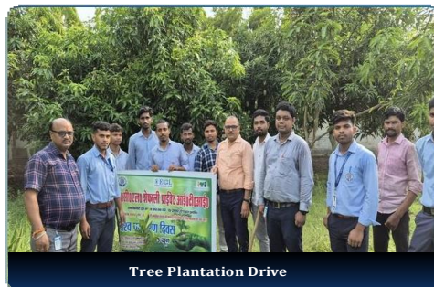
Tree Plantation Drive