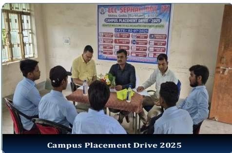
Campus Placement Drive 2025