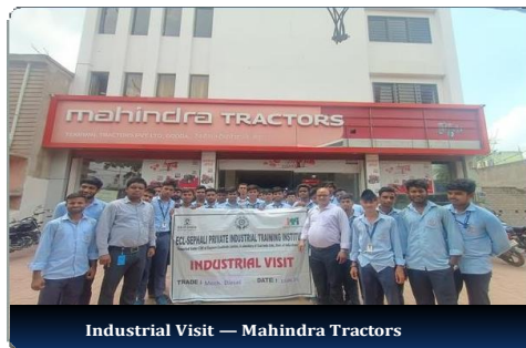
Industrial Visit — Mahindra Tractors