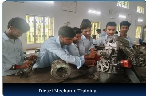
Diesel Mechanic Training