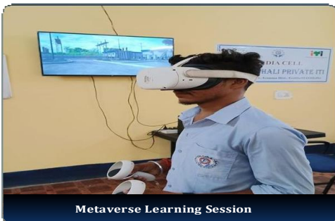
Metaverse Learning Session