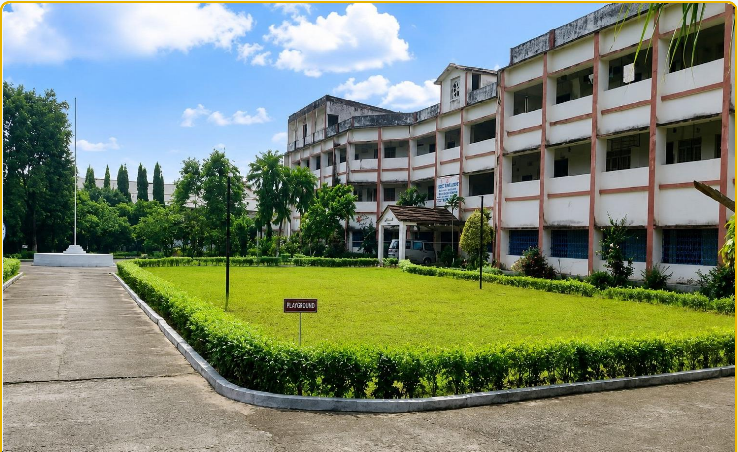
ECL-SEPHALI PRIVATE ITI CAMPUS – SIKATIA, GODDA, JHARKHAND

"Empowering youth with skills today, building tomorrow's workforce for a stronger India."