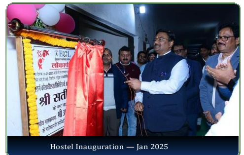
Hostel Inauguration — Jan 2025